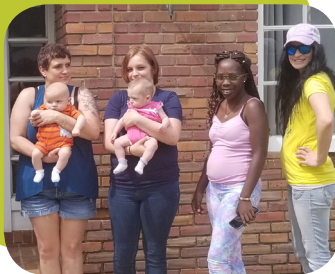
Our Ruston first cohort for the Nurturing Parenting Program graduated 8 participants.