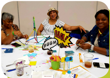
Early childhood educators participate in Summer Spectacular workshop, funded by School Readiness Tax Credits.

Al's Pals, U-ACT and Kids 1st Morehouse were recognized as part of the Maternal, Infant, and Early Childhood Home Visiting (MIECHV) Programs.