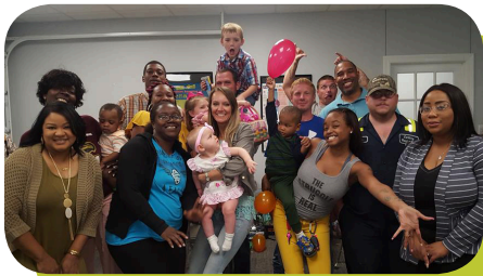
Parents complete 16 weeks of the Nurturing Parenting Program and celebrate milestones